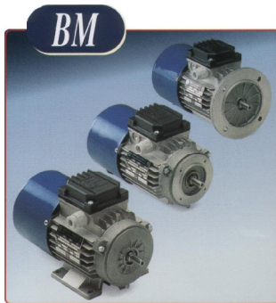
BM Series – Standard Brake Motor

M.G.M. electric motors NA Inc., established in 1950, is a world leading manufacturer of AC electric brake motors. MGM hoisting brake motors, assembled to high mechanical precision, have been designed for these specific application. Thanks to more than 50 years experience MGM is able to provide top quality brake motors together with a reliable service.