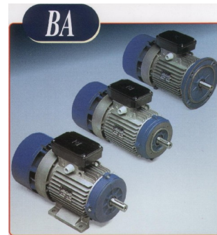
BA Series – High Brake Torque Motor